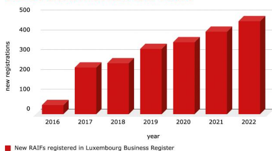
STEADY GROWTH IN NEW RAIF FUNDS

As CSSF-regulated Alternative Investment Fund Manager, or AIFM, Waystone’s Luxembourg unit supported the creation of a record total of 35 new Raifs last year. That is more than double the 17 new funds each created by ONE Fund Management and